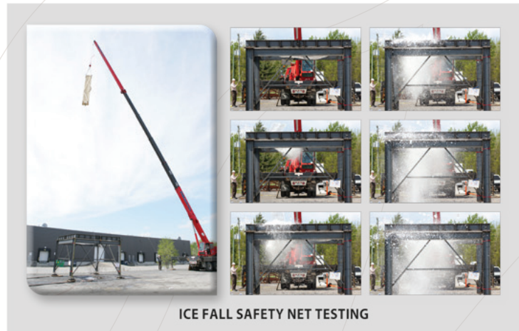
ICE FALL SAFETY NET TESTING

The Barry Team aims to be a world class leader in finding and adapting solutions to complex problems related to rope and net applications worldwide.